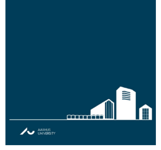
Cover page for a couple of our brochures

Experience a semester at Aarhus University, Denmark